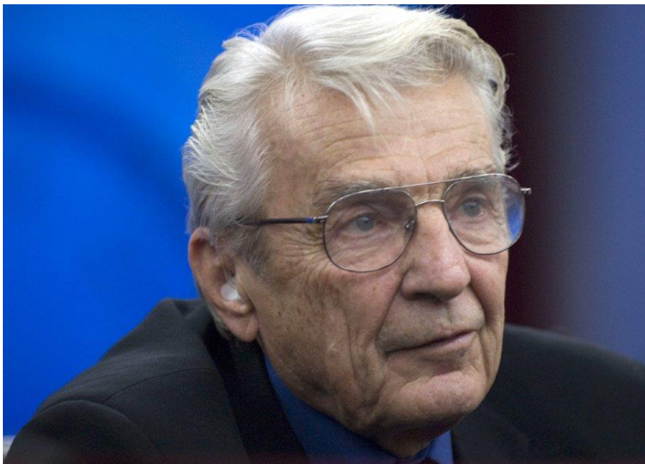
Ivar Giaever in 2008