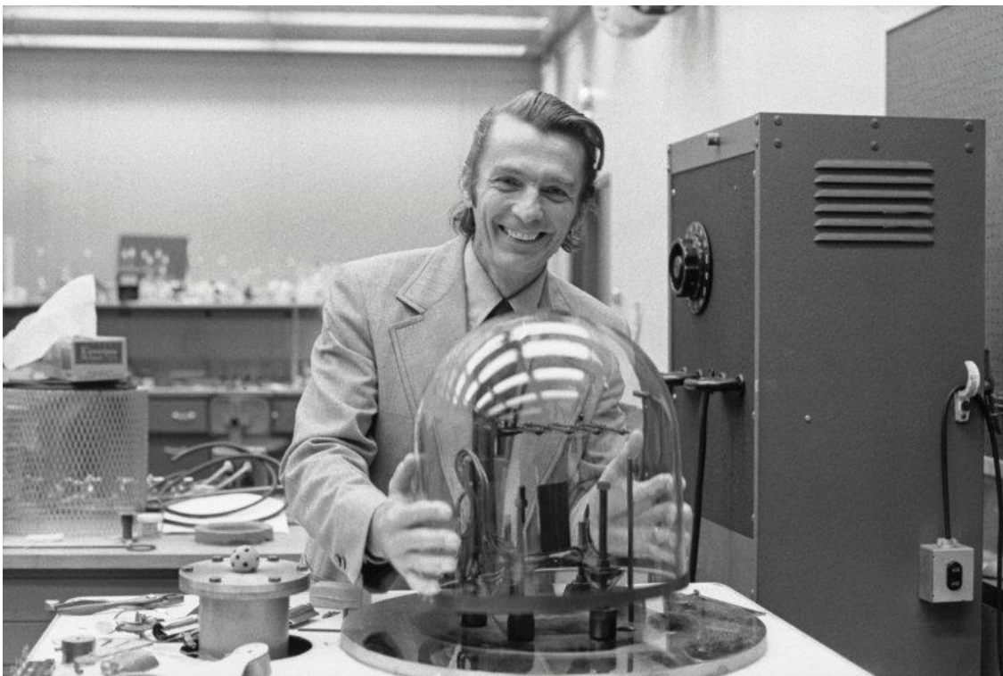
Physicist Giaever in 1973

"Same thing is for tornadoes. We are in a low period on in U.S." (See: Extreme weather failing to follow 'global warming' predictions: Hurricanes, Tornadoes, Droughts, Floods, Wildfires, all see no trend or declining trends )